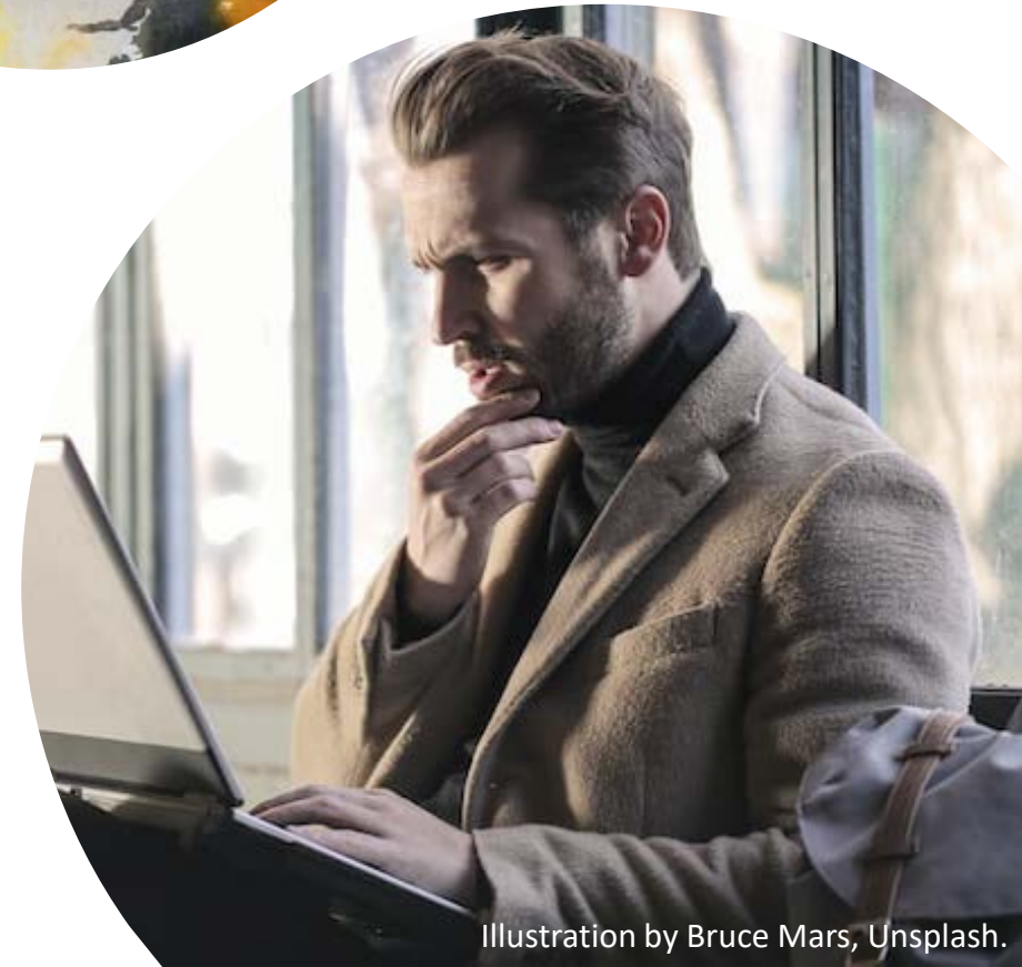
Illustration by Bruce Mars, Unsplash.