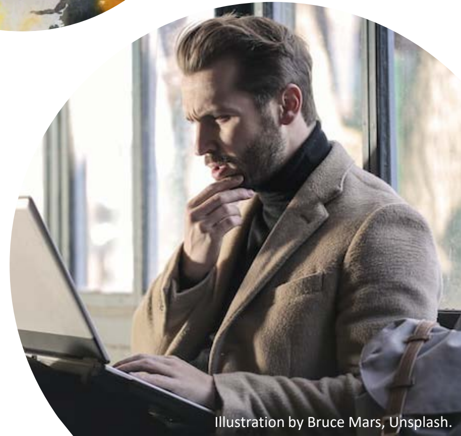
Illustration by Bruce Mars, Unsplash.